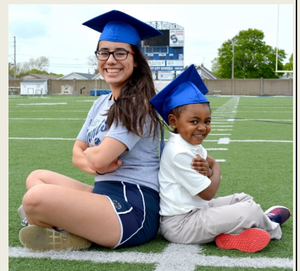
Farewell Class of 2019,